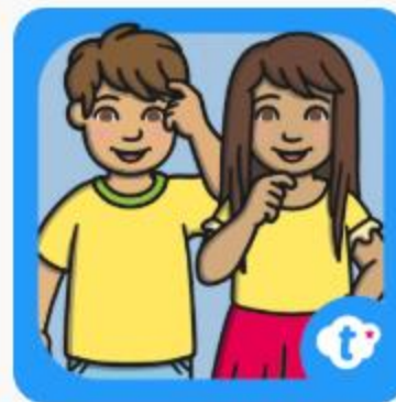
Twinkl Phonics App

I will give you your child's individual username and password for you if you would like to have a look.